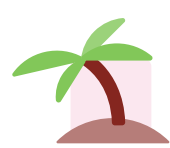
Mediterranean and Macaronesian islands